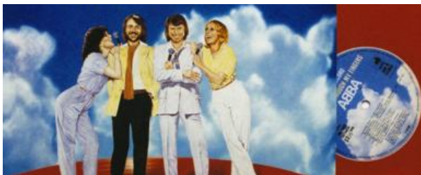
Weekly quiz: Which LPs rocked the vinyl charts?