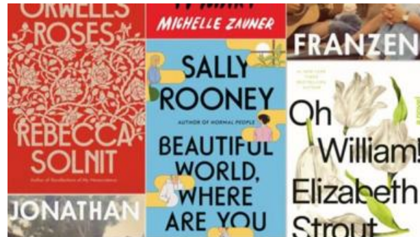
BBC Culture: The best books of 2021