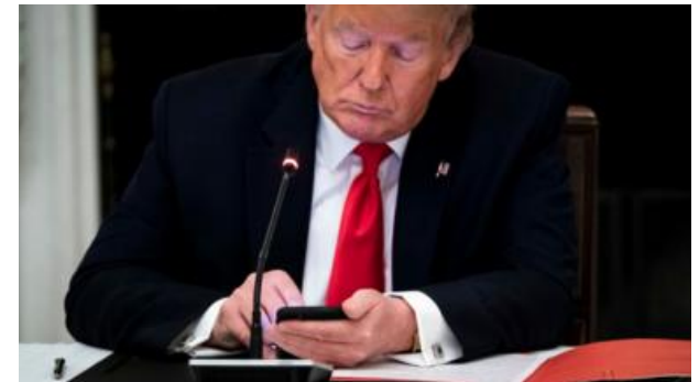
Year in tech: The stories making headlines in 2021