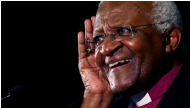
Notable deaths of 2021