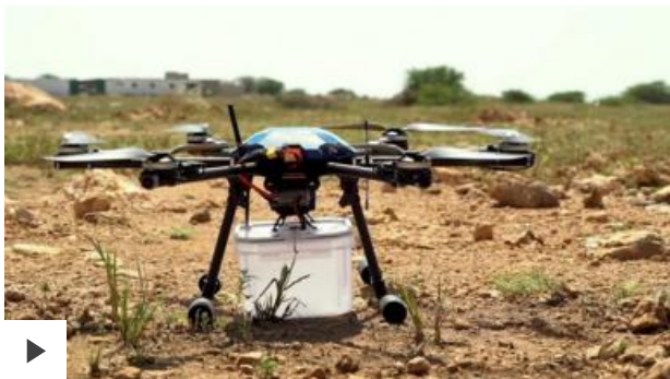
Drone delivers medical supplies to remote islands