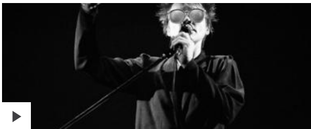
Laurie Anderson's 'heartbreakingly beautiful' art