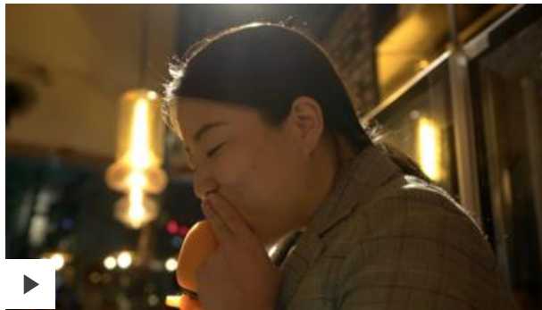
Why Chinese stand-ups are turning to English