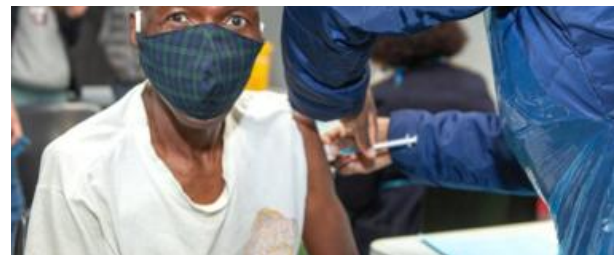
Why most of Africa has missed global vaccine target