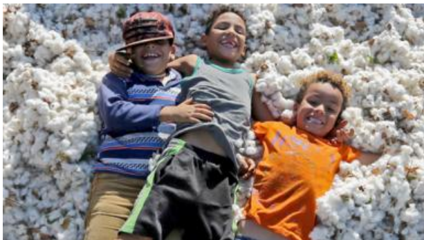
Africa's 2021 top shots: Giggles and coronations